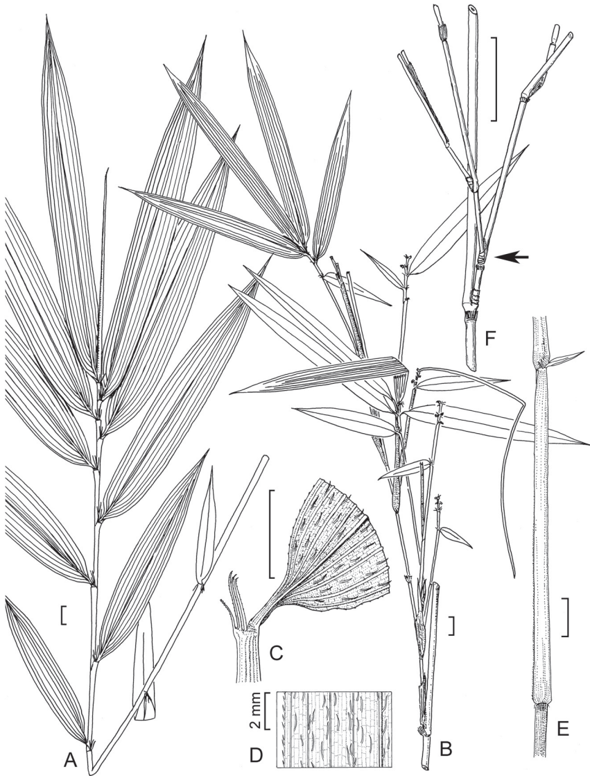
FIG. 2. Arundinaria appalachiana . A. Top knot of new shoot. B. Foliage leaf complement from midculm node. C. Foliage leaf, showing apex of sheath, fimbriae, pseudopetiole, and base of blade. D. Detail of abaxial surface of blade showing tessellation and pilose vestiture. E. Culm leaf at midculm node. F. Branch complement showing compressed basal internodes and reiterative secondary branch (arrow). Scale bar = 1 cm unless otherwise noted. All drawings based on Triplett & Ozaki 99. (Illustrations by J. Triplett)