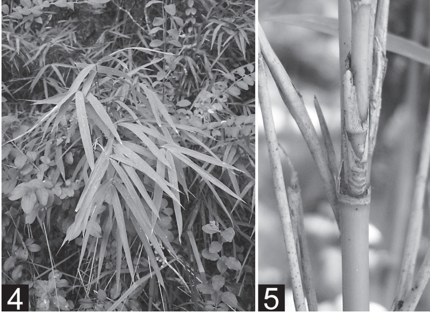
FIGS. 4–5. Arundinaria appalachiana . 4. Habit, in Rhea Co., Tennessee. 5. Close-up of primary branch with compressed basal internodes, Dekalb Co., Alabama. (Photos by J. Triplett)

nate, open-racemose, apparently borne on specialized nonleafy shoots; peduncle 10–17 cm long (3 measured), glabrous, terete; rachis glabrous; pedicels 4–25 mm long; 6–8 spikelets per synflorescence. Spikelets 3–5.5 cm long, laterally compressed, disarticulating above the glumes and between the florets, consisting of 1(–2) glumes, occasionally a basal sterile floret, 5–8 fertile florets and 1–3 progressively rudimentary apical sterile florets; rachilla internodes 3–4 mm long; glumes unequal, 5-nerved, attenuate, glabrous; glume I 3–6.5 mm long; glume II 5.5–9 mm long; fertile lemmas 11–16 mm long, 7–11-nerved, apex acute or acuminate, abaxially glabrous, transverse veinlets barely perceptible or not at all manifest, usually somewhat reddish-purple; paleas 10–13 mm long, 8–10-nerved, broadly sulcate and 2-keeled dorsally; lodicules and ovary not seen. Stamens 3; anthers 5–7 mm long. Fruit not seen.