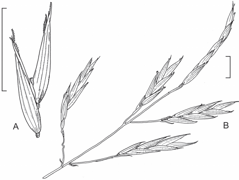
FIG. 3. Arundinaria appalachiana . A. Partially dissected spikelet showing two florets. B. Synflorescence with five spikelets. Scale bar = 1 cm. Drawings based on Ahles & Leisner 15147. (Illustrations by J. Triplett)

briae 1–9 mm, ascending to erect; blades (5–)9–22.5 cm long, 1.4–2.8 cm wide, L:W = 8.3–9.3, linear, linear-lanceolate or ovate-lanceolate, chartaceous, pilose or glabrous, abaxially weakly tessellate, apices acuminate, bases attenuate to cuneate, midrib \pm centric. Branching infravaginal (rarely extravaginal); primary branches 1 per node, 7–33 cm long, with 2–5 compressed basal internodes, basal nodes not developing secondary branches; first elongated internode shorter than subsequent ones ( \sim 30%); higher order branches present on older plants, reiterating the 1° branch (i.e., with the same pattern of compressed basal internodes and branching). Foliage leaves 3–7 per complement; sheaths glabrous, margins ciliate, weakly tessellate; auricles absent; fimbriae 1–9 mm, ascending to erect; inner ligule glabrous or ciliate, fimbriate or lacerate; outer ligule present as a minute rim; blades linear, linear-lanceolate, or ovate-lanceolate, chartaceous, deciduous, surfaces pilose (sometimes glabrous), abaxially weakly tessellate, apices acuminate, bases attenuate to cuneate, midrib \pm centric; primary branch foliage leaf blades (4–)9–20 cm long, (0.5–)0.8–2 cm wide; L:W = 10.7–11.7; higher order branch foliage leaf blades (3–)5–17.5 cm long, (0.5–)0.8–1.5 cm wide; terminal foliage leaf blade rarely unexpanded laterally, withering but persisting as a tail-like appendage. Synflorescences 7–11.5 cm long, 2–5 cm wide, determi-